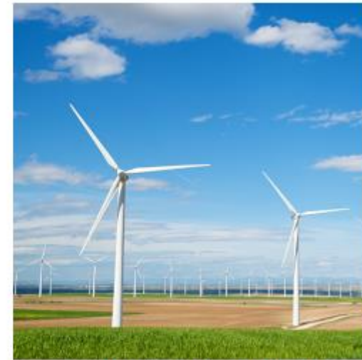
powered by wind