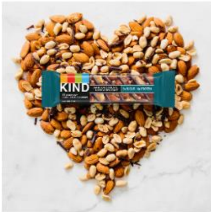
the kind promise

Our promise to you is that our products will always lead with a nutrient-dense first ingredient, such as nuts, whole grains or fruit – a disruptive notion that sparked the creation of a new healthy snacking category. We aim to challenge the status quo within the food industry and empower our community to make better, informed choices about health.