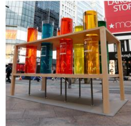
exposing misleading claims & hidden ingredients